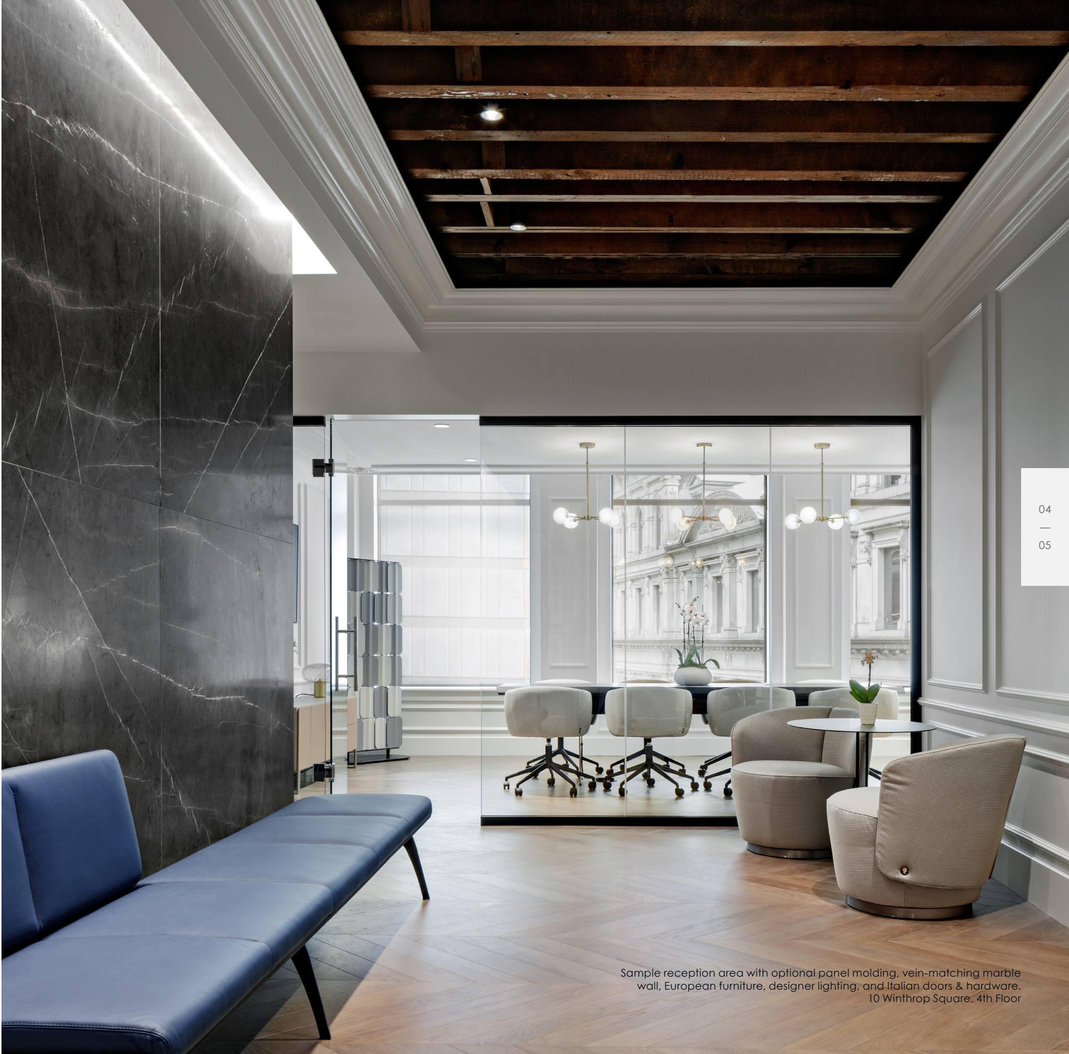
Sample reception area with optional panel molding, vein-matching marble wall, European furniture, designer lighting, and Italian doors & hardware. 10 Winthrop Square, 4th Floor

Where one hosts and entertains is where one forms the most important, valuable relationships. Like an investment in a luxury home, 10 Winthrop Square provides a luxe office environment that allows tenants to show the immense value they place on their professional relationships and interactions, while also providing a sought after environment for corporate cohesion, culture and efficiency.